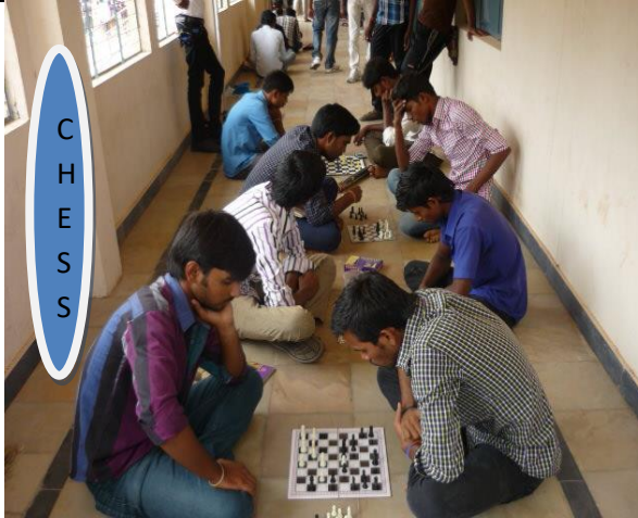
C H E S S